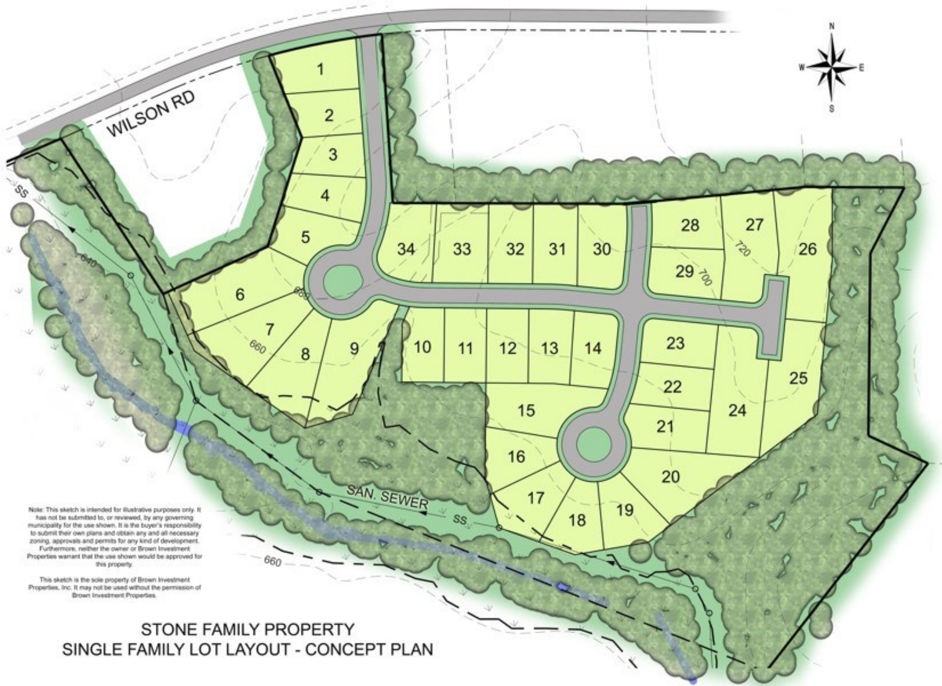
STONE FAMILY PROPERTY SINGLE FAMILY LOT LAYOUT - CONCEPT PLAN