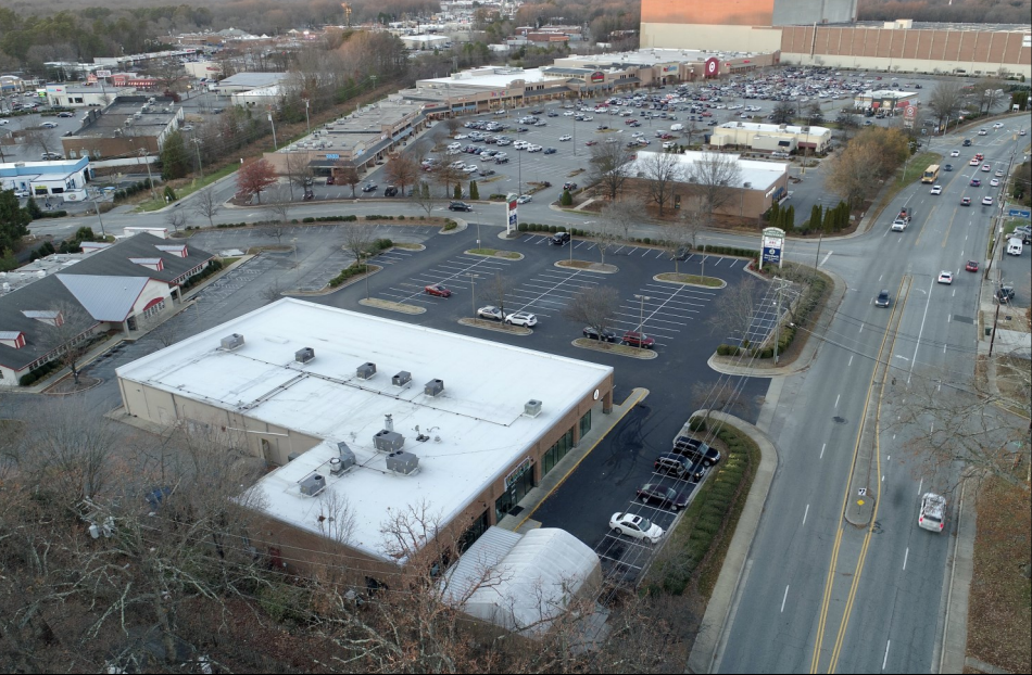
The statements and figures herein while not guaranteed are secured from sources believed to be authoritative. This offering is subject to change of price, prior lease or sale and or withdrawal without notice. Prospects should verify all information. Variable commission for Brokers.