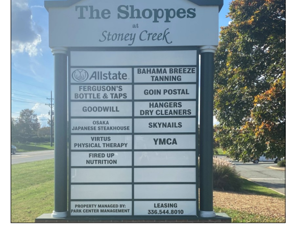
952 Golf House Road