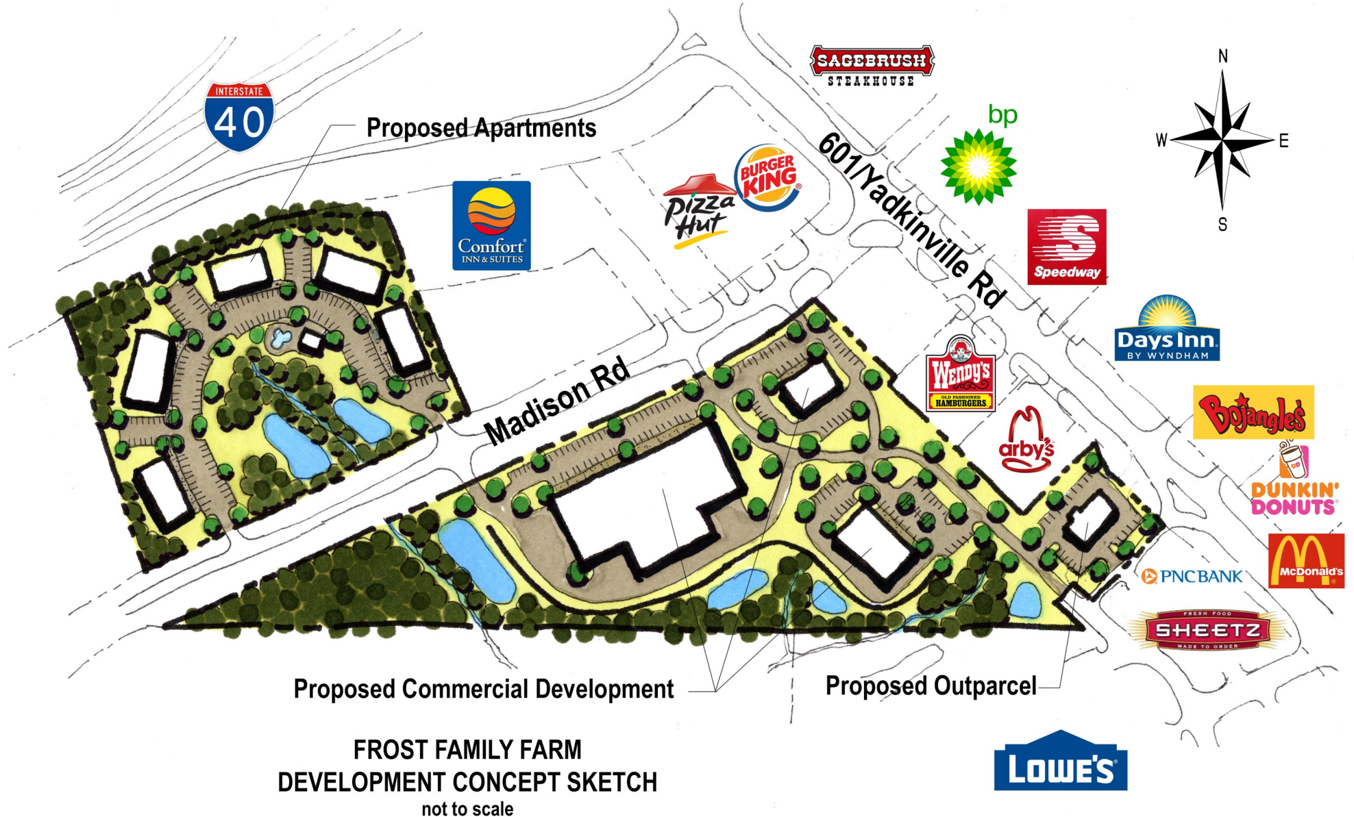
FROST FAMILY FARM DEVELOPMENT CONCEPT SKETCH not to scale

Note: This sketch is intended for illustrative purposes only. It has not been submitted to, or reviewed by, any governing municipality for the uses shown. It is the buyer's responsibility to submit their own plans and obtain any and all necessary zoning, approvals and permits for any kind of development. Furthermore, the owners of the property do not warrant that the uses shown would be approved for this property. This sketch is the sole property of Brown Investment Properties. It may not be used without the permission of Brown Investment Properties.