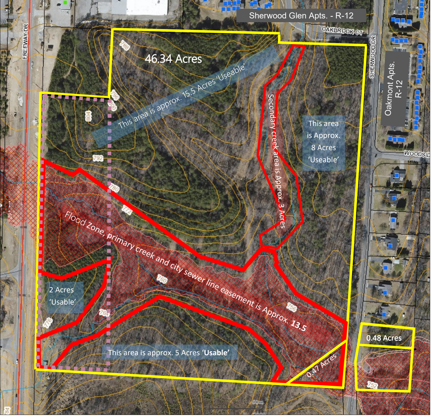
The statements and figures herein while not guaranteed are secured from sources believed to be authoritative. This offering is subject to change of price, prior lease or sale and or withdrawal without notice. Prospects should verify all information.

1007 Battleground Avenue, Suite 401 Greensboro, NC 27408 336-379-8771 I www.bipinc.com