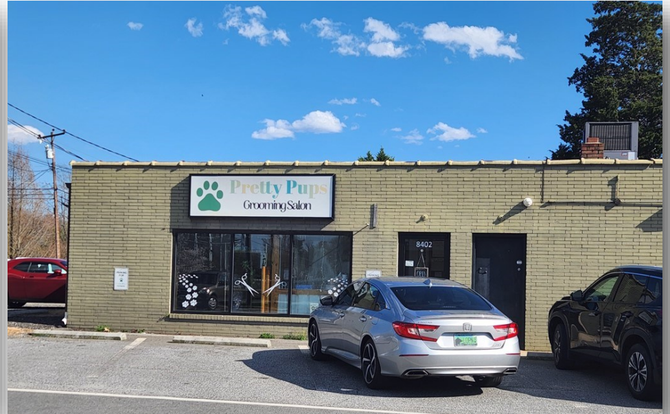
Five tenant retail shops