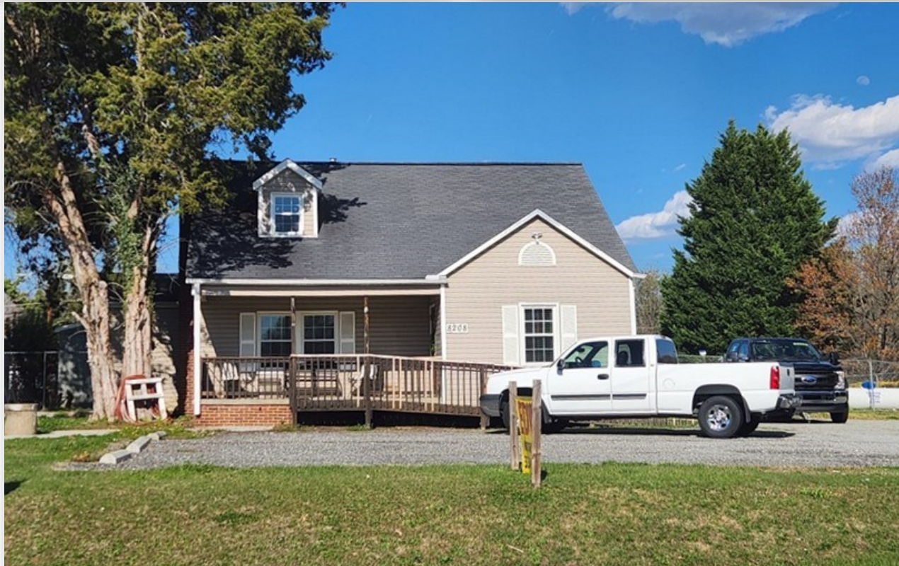
Free standing retail building included in sale