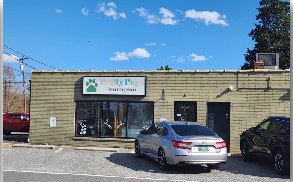
Five tenant retail shops