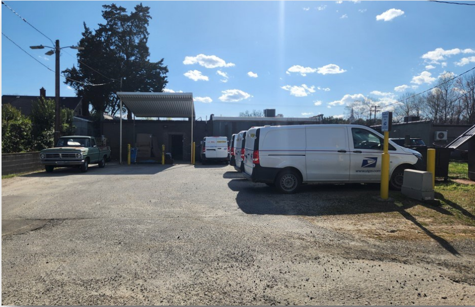
Additional parking behind Strip Center