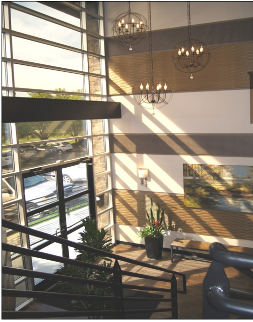
The statements and figures herein while not guaranteed are secured from sources believed to be authoritative. This offering is subject to change of price, prior lease or sale and or withdrawal without notice. Prospects should verify all information.