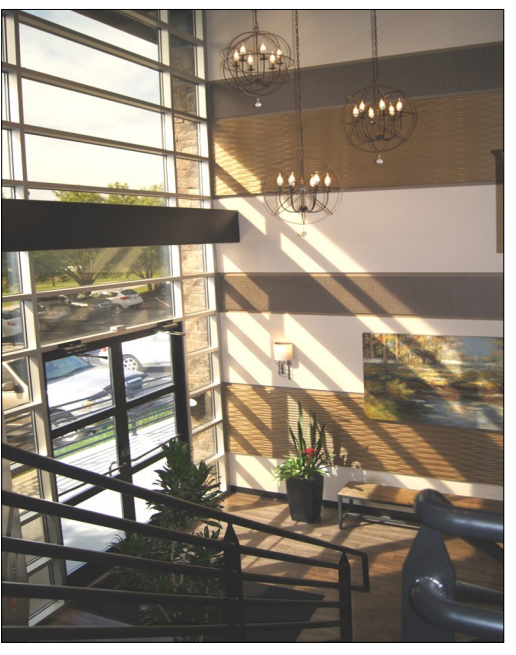
The statements and figures herein while not guaranteed are secured from sources believed to be authoritative. This offering is subject to change of price, prior lease or sale and or withdrawal without notice. Prospects should verify all information.