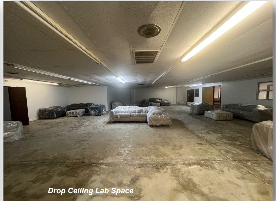
Drop Ceiling Lab Space