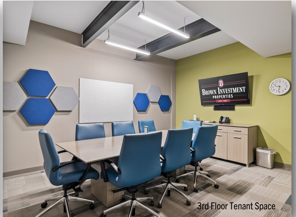
3rd Floor Tenant Space