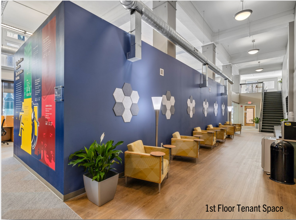
1st Floor Tenant Space