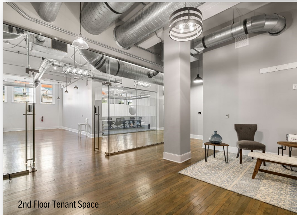
2nd Floor Tenant Space