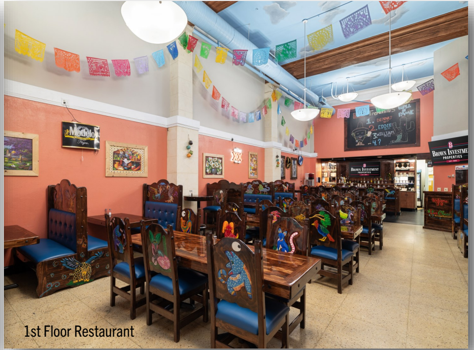
1st Floor Restaurant