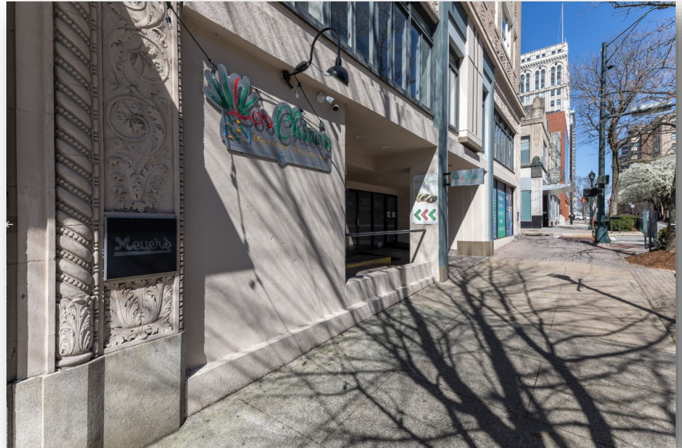
Building Entrance on Elm Street

Full Offering Memorandum available upon request with CA agreement