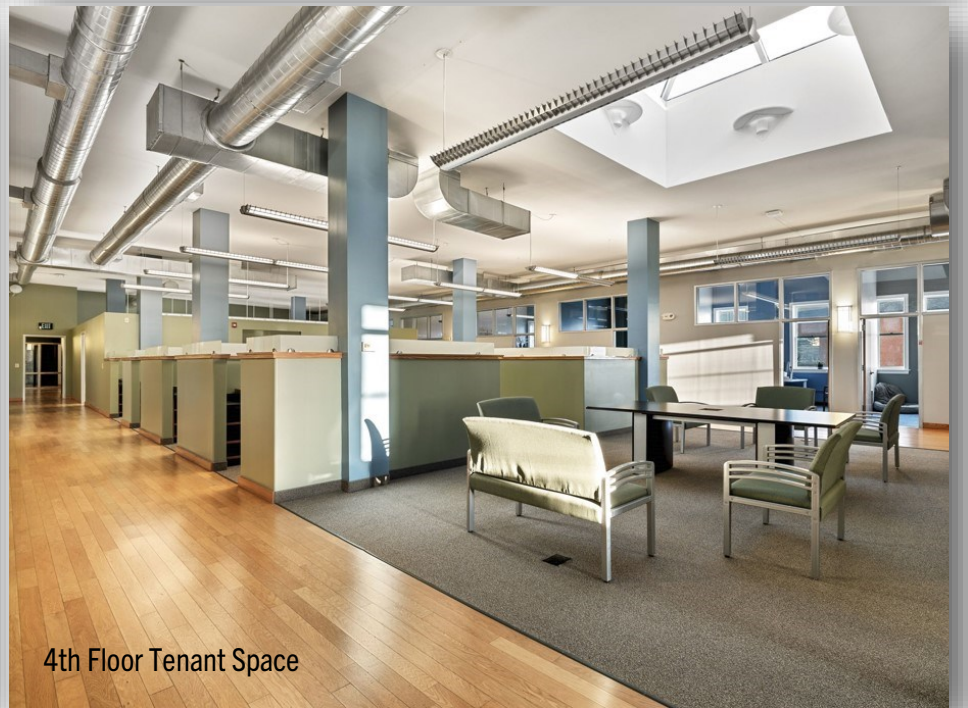
4th Floor Tenant Space