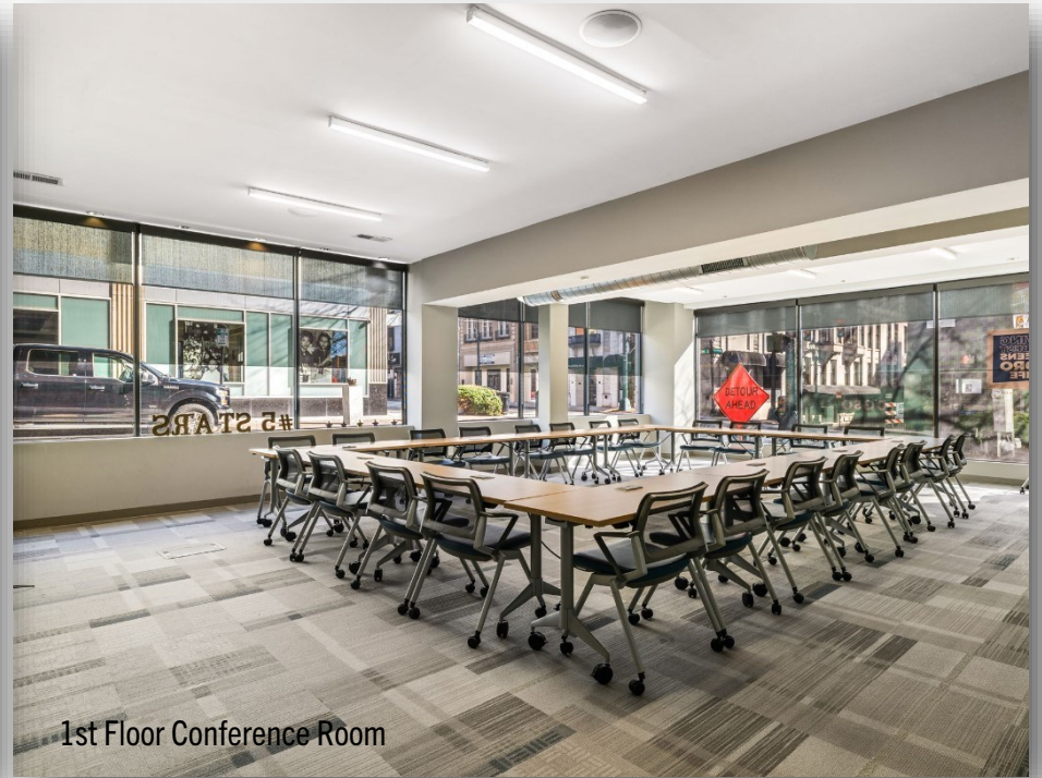
1st Floor Conference Room