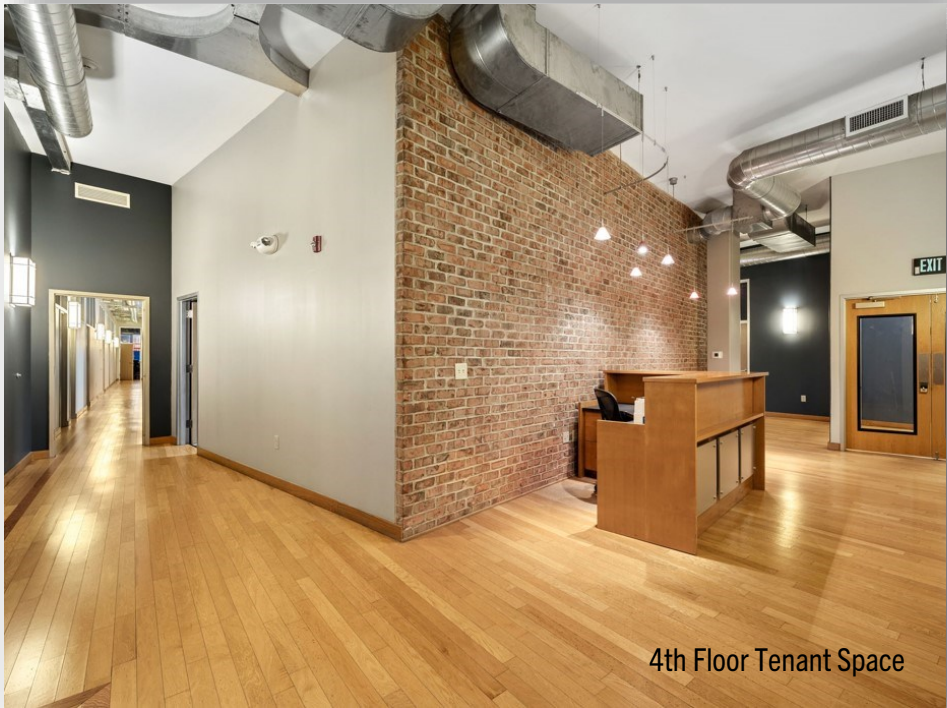
4th Floor Tenant Space