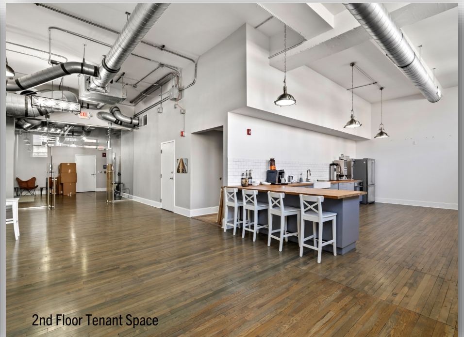
2nd Floor Tenant Space