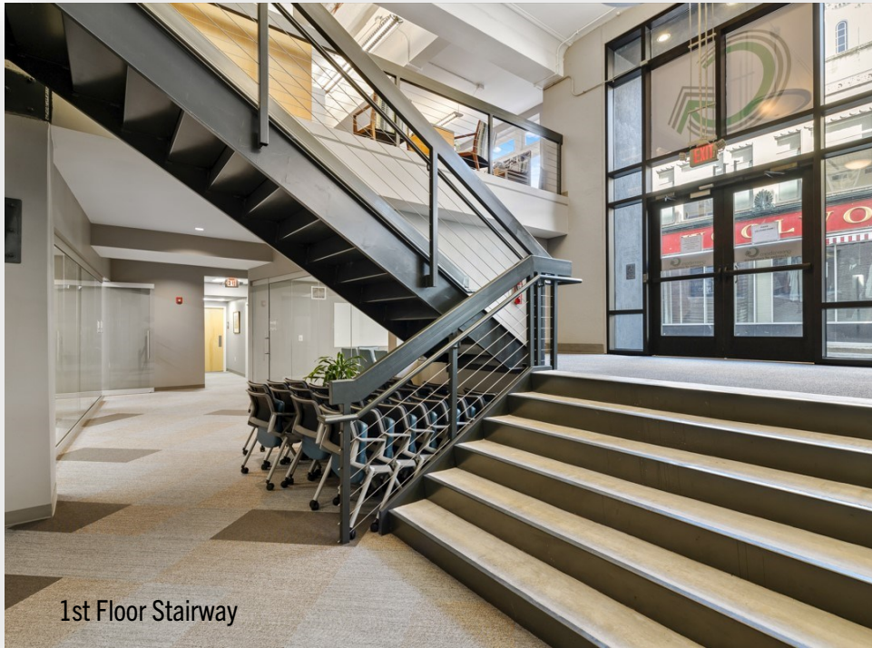
1st Floor Stairway