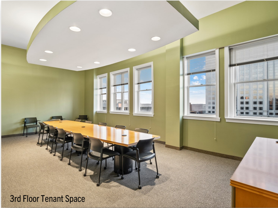
3rd Floor Tenant Space